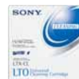
LTX-CL Universal Cleaning Cartridge

The dedicated servo writer that Sony developed for the LTO format provides a high-quality magnetic servo signal, which complements the enhanced performance of the tape itself. The result is significantly improved data writing and reading accuracy