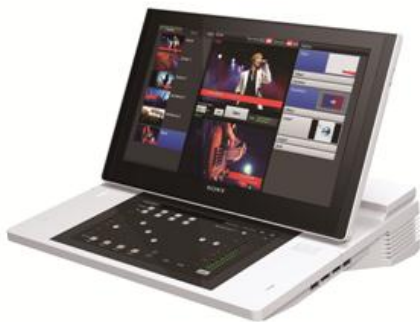
Sony's Anycast Touch live production system

The Anycast Touch system combines a video switcher, audio mixer, special effects generator, PTZ camera control, a real-time streaming encoder, image still store, character generator, and scale converter. It uses a sliding, dual touch-screen interface similar to a tablet. A unique tilt-screen function allows the two dual screens to split video and audio controls and conveniently store them in scene folders with settings including titles, logos and effects. Operators can recall the next video source just by touching its thumbnail picture, and content can be easily streamed live over the internet or a dedicated network.