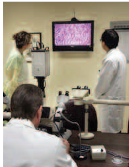
Three pathologists view HD image of a slide.