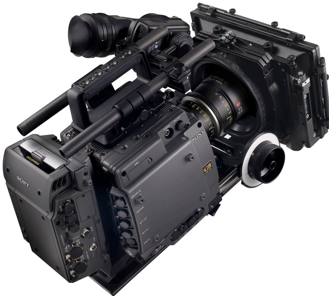
The F65 camera docked to the equally remarkable SR-R4 SRMASTER field recorder.

The F65 benefits from a dedicated, docking field recorder: the SR-R4. (Expected availability: January 2012).