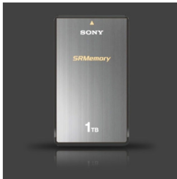
Remarkable to see on a memory card: the designation "1 TB."

About the size of a smart phone, the SRMemory card delivers capacity and transfer speed far beyond previous cards. Where HDCAM SR tape achieves a sustained 440 and 880 Mbps and SxS™ cards can achieve momentary bursts of up to 1.2 Gbps 1 , SRMemory cards go much further. Sustained write speed is 5 Gbps. Made possible by dedicated memory controller circuits inside each card, this speed is a vital advantage when you're backing up your original camera masters after a day's shoot. The maximum capacity of 1 Terabyte (1,000 GB 2 ) exceeds any previous memory card. 3 Other cards will be offered in capacities of 256 GB 2 and 512 GB. 2