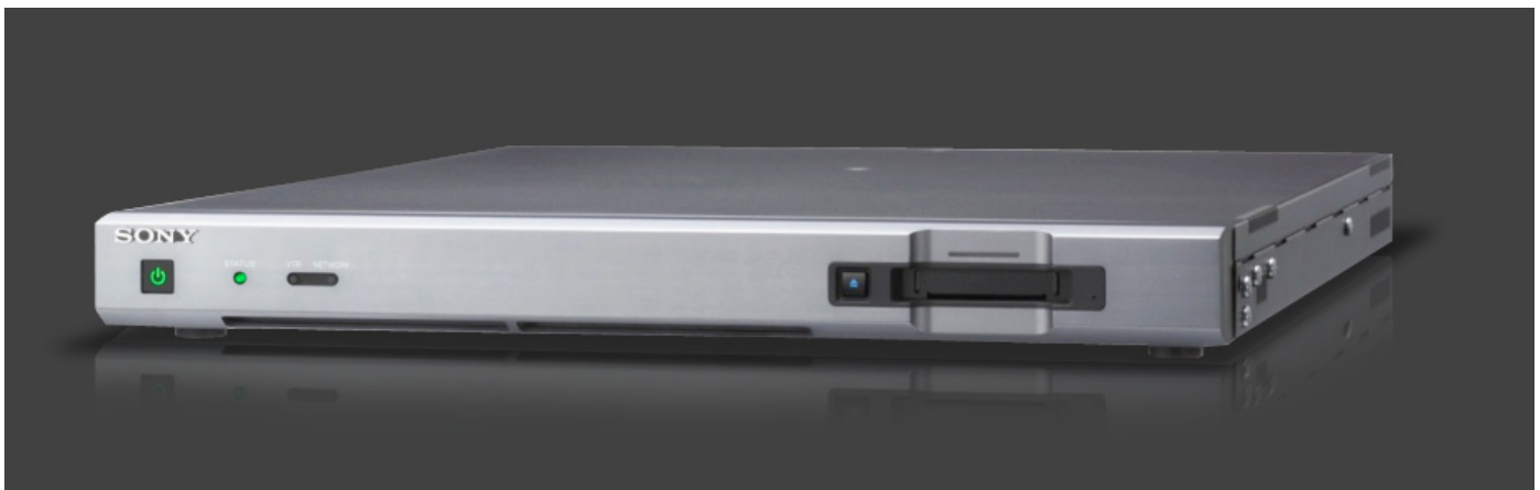
The SRPC-5 transfer station features a 10 Gigabit Ethernet interface.

4. 1 TB equals one trillion bytes, a portion of which is used for data management functions.