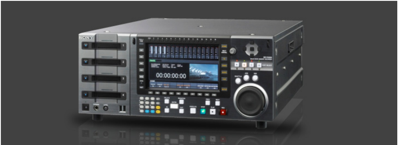
The SR-R1000 multi-channel server has slots for four SRMemory cards.

The SRMASTER platform has you covered from the set, through data backup and well into post production. Sony provides the entire process, end to end. To back up your precious original camera masters, Sony created the SR-R1000 deck (expected availability September 2011). The SR-R1000 is essentially a multi-channel server, with four SRMemory card slots and up to 8 TB 4 of internal memory storage. Depending on the type of data, up to four SRMemory cards can be ingested at the same time. A 1 TB SRMemory card can store about an hour of F65 16-bit RAW data. The SR-R1000 can offload a full 1 TB card in less than 30 minutes, moving the data into internal memory storage. This makes the R1000 ideal for efficient data management on the set and in the post production studio.