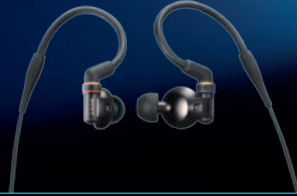
MDR-7550 In-Ear Monitors (IEM)