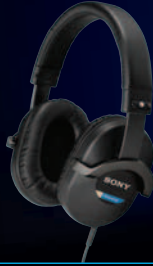
MDR-7510 Studio Headphones