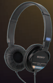
MDR-7502 Studio Headphones