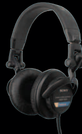
MDR-7505 Studio Headphones