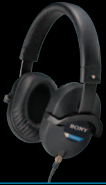
MDR-7520 Studio Headphones