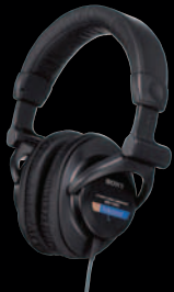
MDR-7509HD Studio Headphones