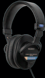
MDR-7506 Studio Headphones